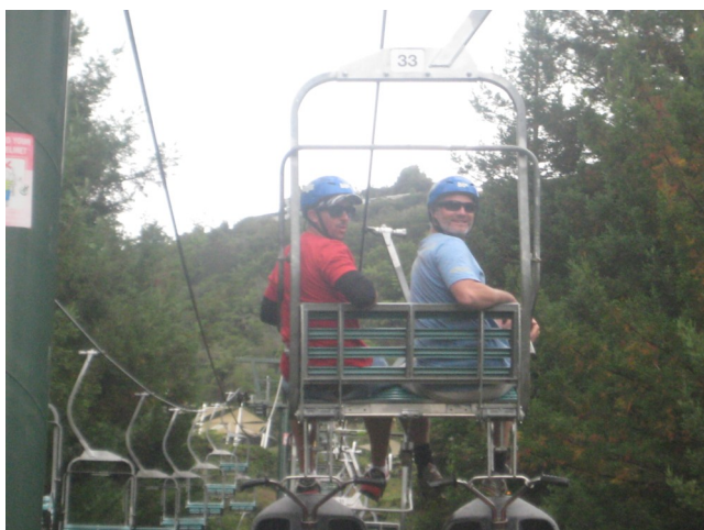
A DAY ON THE LUGE