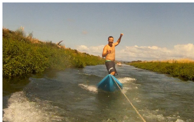
THE ANNUAL CANNEL CRUISE