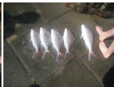
2 FOOT SNAPPER. LOL