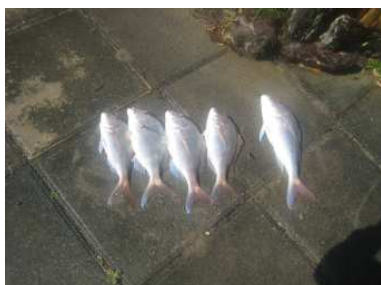
THE LONG LINE