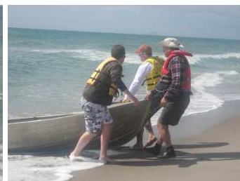
THE PULL UP