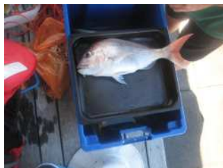
FINALLY SOME FISH