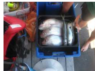
SOME BAIT TO TOP IT OFF

Well testing part 2 over Christmas was over and done with in a few days, Bad weather came in and we only had one day to get out for a few hours.. Report is soft baits work well with the Kahawai. I used the Slam bait fish type. Was having strikes 80% of the time. So if you want to bring some soft baits or a spinning rod feel free to. The rest were snapper and some mullet that will be used for bait. Boats all look well expect for one that has its own live tank in the bottom of the floor. Na wasn't too bad. All should be fixed by the time we come over or we may have a day in the workshop.. Manufacturing some Burleigh buckets and also rod holders. All we need is recliners and will be a comfy week of fishing.