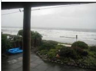
THE WEATHER - SHIT