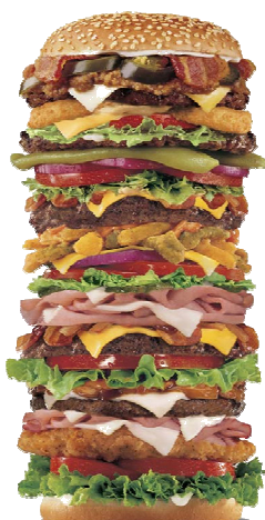
IMAGE MAY NOT REFLECT THE ACTUAL BURGER

By popular choice the winning meal for the first night will be hamburgers. This will be a build your own meal with probably a side of chips.